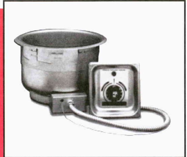
MODEL SM-50-11D UL HOT FOOD WELL