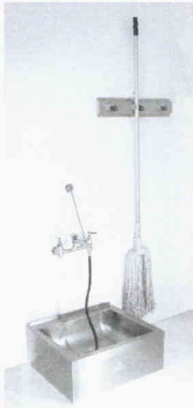
9-OP-20 shown with optional faucet, hose & hanger