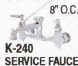
K-240 SERVICE FAUCET