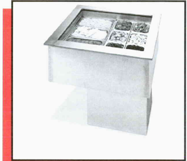
DROP-IN COLD WELL